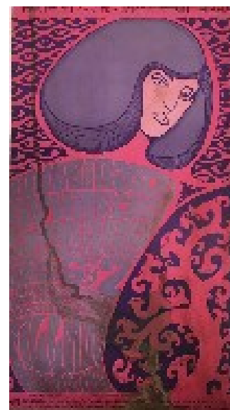
Presented in San Francisco by Bill Graham Young Rascals, Sopwith Camel, The Doors, Fillmore Auditorium. Artwork by Wes Wilson: lithograph poster.

The posters were cataloged at the item level using an ArchivesSpace import template of an Excel spreadsheet and sorted into ten series: Pro-drugs; Anti-drugs; Sex; Musical Performances; Literary Events; Theatrical Performances; Art Exhibitions; Political Propaganda; Advertisements; and Miscellaneous. The bulk of the collection dates