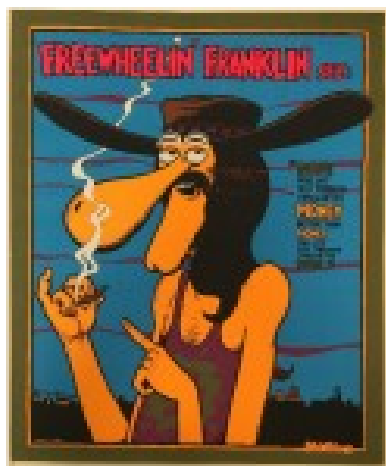
Freewheelin' Franklin sez: "Dope will get you through times of no money better than money will get you through times of no dope." Artwork by Gilbert Shelton: blacklight poster.

Given the particular challenges of titling posters, which have no standard for title creation, and my own inexperience with cataloging posters, we were happy to find that there are a number of logical steps that can be taken when deciding on title information. I found it was often possible to include all of the poster language, but when it wasn't, making decisions about the most important text