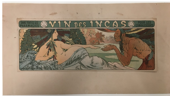
Vin de Incas pour les convalescents, divinite Incas refusant la coca à son peuple. Artwork by Mucha: lithograph poster.

Although there were many physical, spatial, and descriptive challenges, the project was a tremendous team effort and great success, in large part because so many people gave their time and energy to problem-solving and jumped in to help out. It was truly exciting to learn so much about poster art and the counterculture, and to have the time and resources to catalog the Ludlow-Santo Domingo Library poster collection.